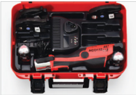
Velpex Mini Tool Kit 16-40