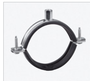
Velpex Pipe Clamps