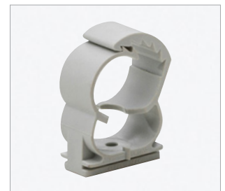
Velpex Quick Clip