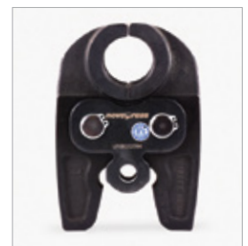
Velpex Mini Jaws * Suits Novopress ACO153