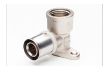
Female Lugged Elbow