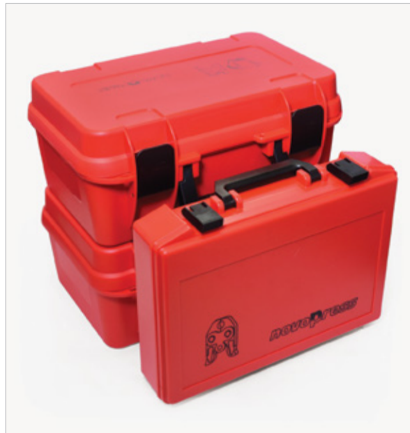
Velpex Jaw Kit 16-63 * Suits Novopress ACO203