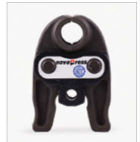
Velpex Jaws * Suits Novopress ACO203