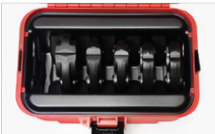
Velpex Mini Jaw Kit 16-40 * Suits Novopress ACO153